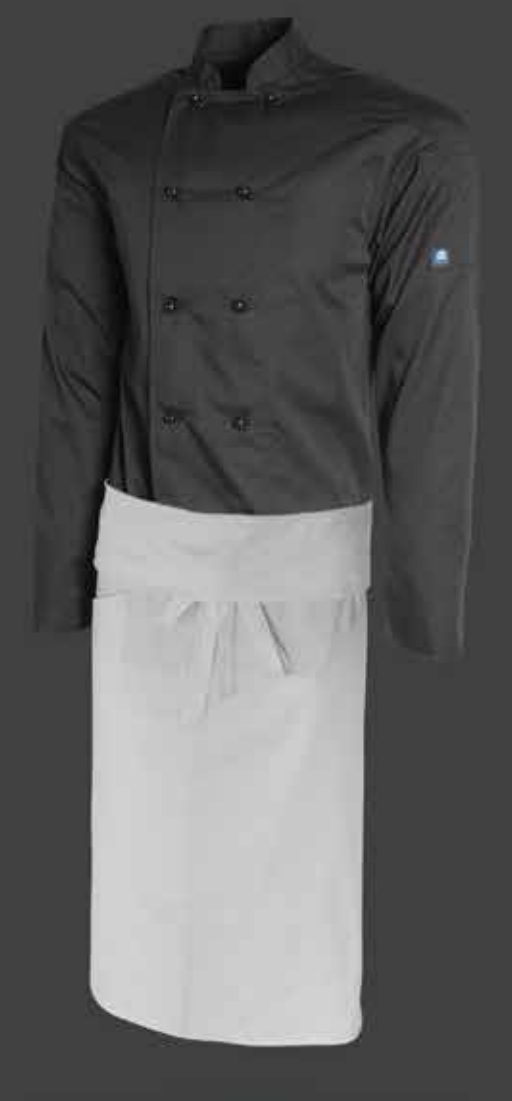
# CBAPN002 - Black