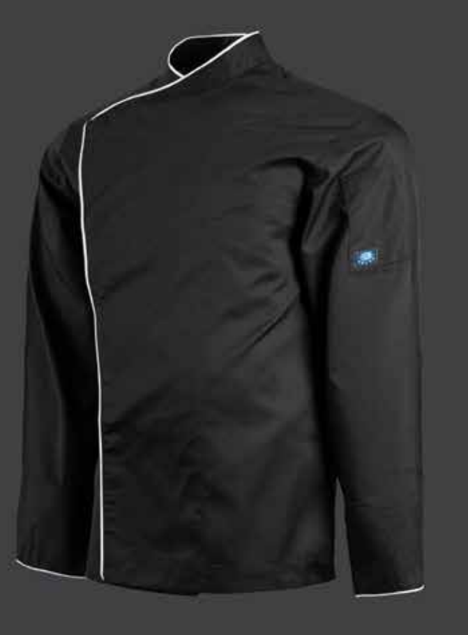
# CBJKT003 - Plain White