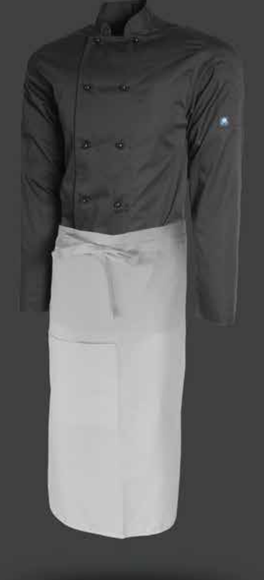
# CBAPN001 - Black