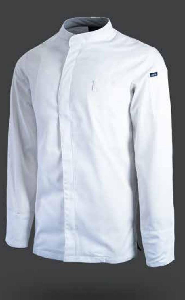
# CBJKT010 - White