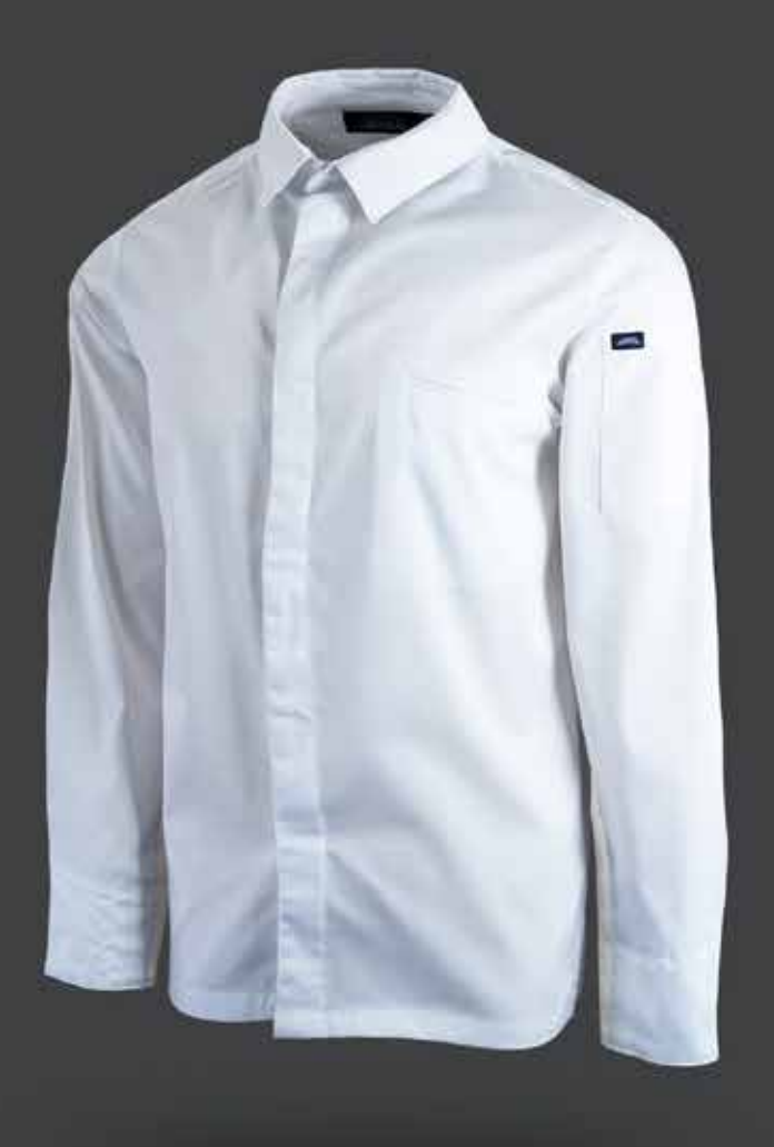
# CBJKT011 - White