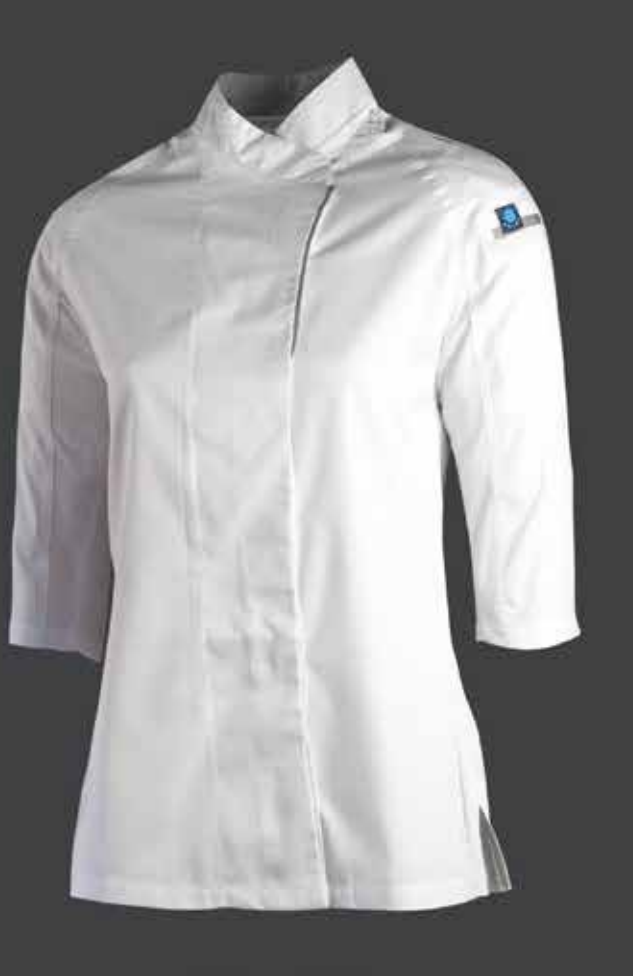
# CBJKT005 - White