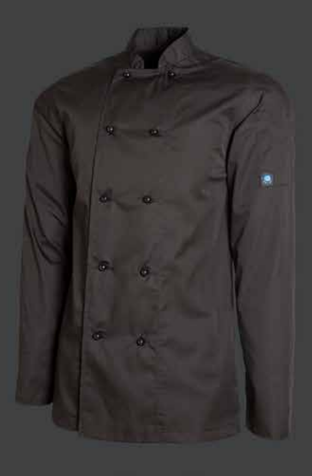
# CBJKT002 - Black