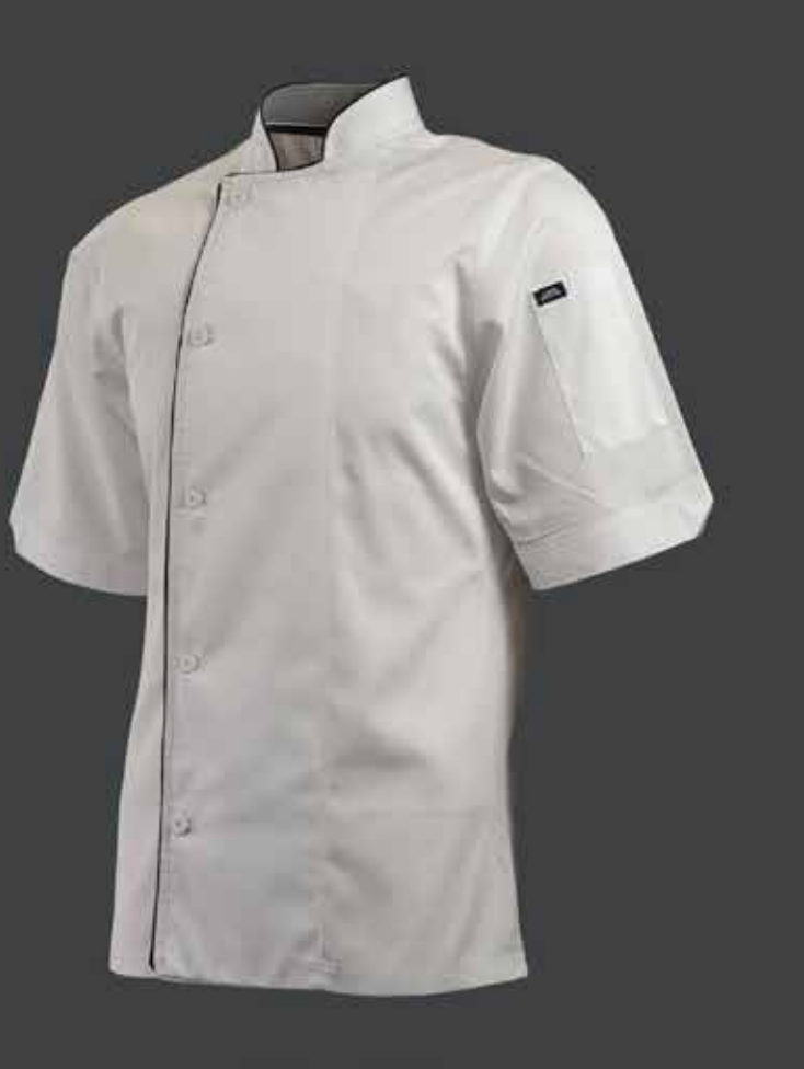
# CBJKT009 - White