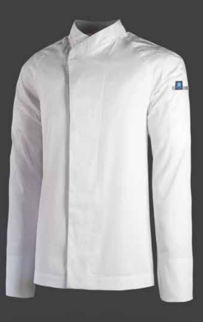
# CBJKT004 - White